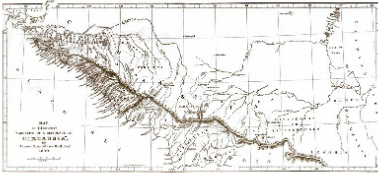
Circassia in the 19th century.

The once mighty Circassians were subjected to systematic genocide and ethnic cleansing by the Russians in the 18th and 19th centuries.