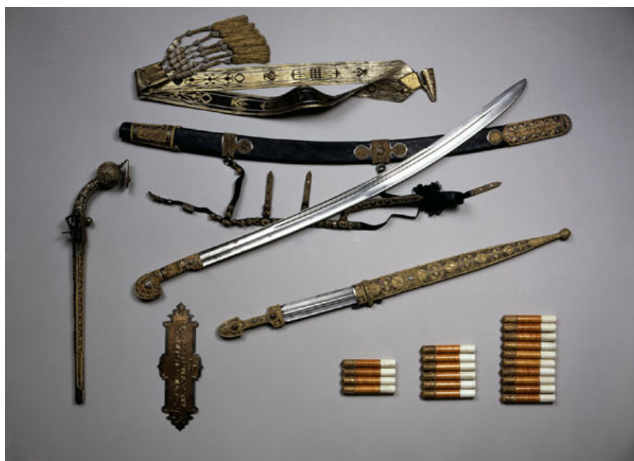
Full weapon set of Kabardian warrior (sword with sword-belt, dagger, pistol, cartridge cases). The set was presented to Tzarevich Nikolai Alexandrovich (future emperor Nicholas II) in 1888 by a North Caucasian deputation.