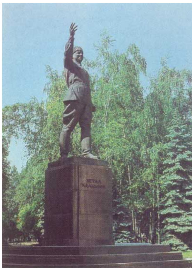
Monument to Betal Kalmyk,

The leader of Bolsheviks in Kabardino-Balkaria was Betal Kalmyk (КЪАЛМЫКЪ БЕТІАЛ; Qalmıq Beit'al; 1893-1940), a local Kabardian. He led Red Army units during the Civil War. Thus, Circassians fought on both sides of the divide. Kalmyk was Chairman of the Kabardian Oblast Executive Committee from 1921 to 1930. Thereafter he was First Secretary of the Kabardino-Balkarian Oblast Party Committee until 1938, effectively the most powerful executive.