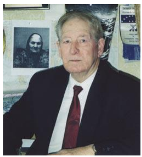
Asker Hedeghel'e is an iconic researcher and folklorist.

It is markworthy that after World War II the Circassian and Ossetic versions of the Epos were withdrawn for some time for 'treatment' and removal of 'elements of an ideology foreign to the people.' (V. Astemirov, 1959, p94)