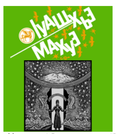
The emblem of the 'Waschhemaxwe («Іуащхьэмахуэ»; "Mount Elbrus") Journal. The spread of literacy in Circassian amongst the diaspora Circassians would boost the circulation of the literary outputs in the Caucasus.

The literary and cultural almanac Qeberdey («Къэбэрдей»; 'Kabarda') was the organ of the Union of Soviet Writers of Kabarda. It was published in Nalchik starting from 1948 in Kabardian. The most prestigious and influential literary journal is 'Waschhemaxwe («Іуащхьэмахуэ»; Mount Elbrus), published by the Union of the Writers of the Kabardino-Balkarian ASSR. The first issue of the monthly came out in 1958. The journal also deals with historical and artistic matters. Since 1991, it has been published by the Union of the Circassian Writers of the Kabardino-Balkarian Republic once every two months. Less than 3,000 copies of each edition of the Journal are published. Thenceforth, taboo subjects were forcefully breached. Literary Kabardino-Balkaria was the Russian language organ of the Union. All these journals, Nur included, were subsidized by the government. All writers were members in the Union and were paid salaries.